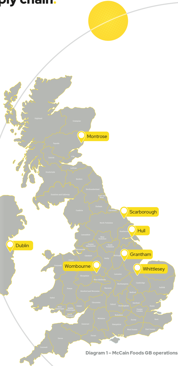
Diagram 1 - McCain Foods GB operations

The supply chain 1 of products and services that contribute to our operations includes raw agricultural materials - the top categories being potato and other commodities, including frying oils and dairy. McCain Foods GB is the largest purchaser of British potatoes and, in FY23, our largest category of spend was on agricultural products and specifically potatoes - procured from 271 contracted suppliers, while other ingredients and raw materials were sourced from 29 suppliers in 12 countries.